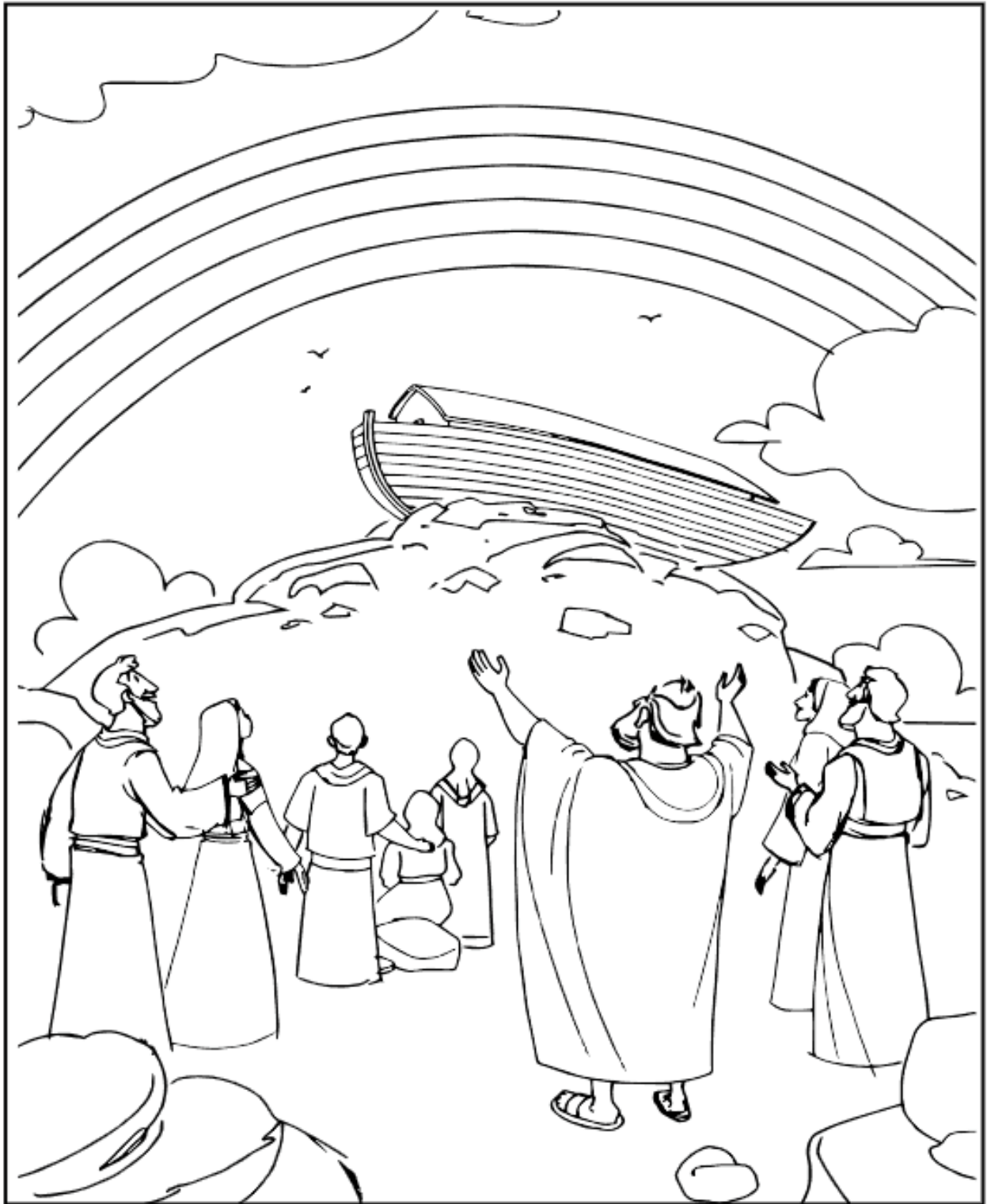
God made a promise to Noah.